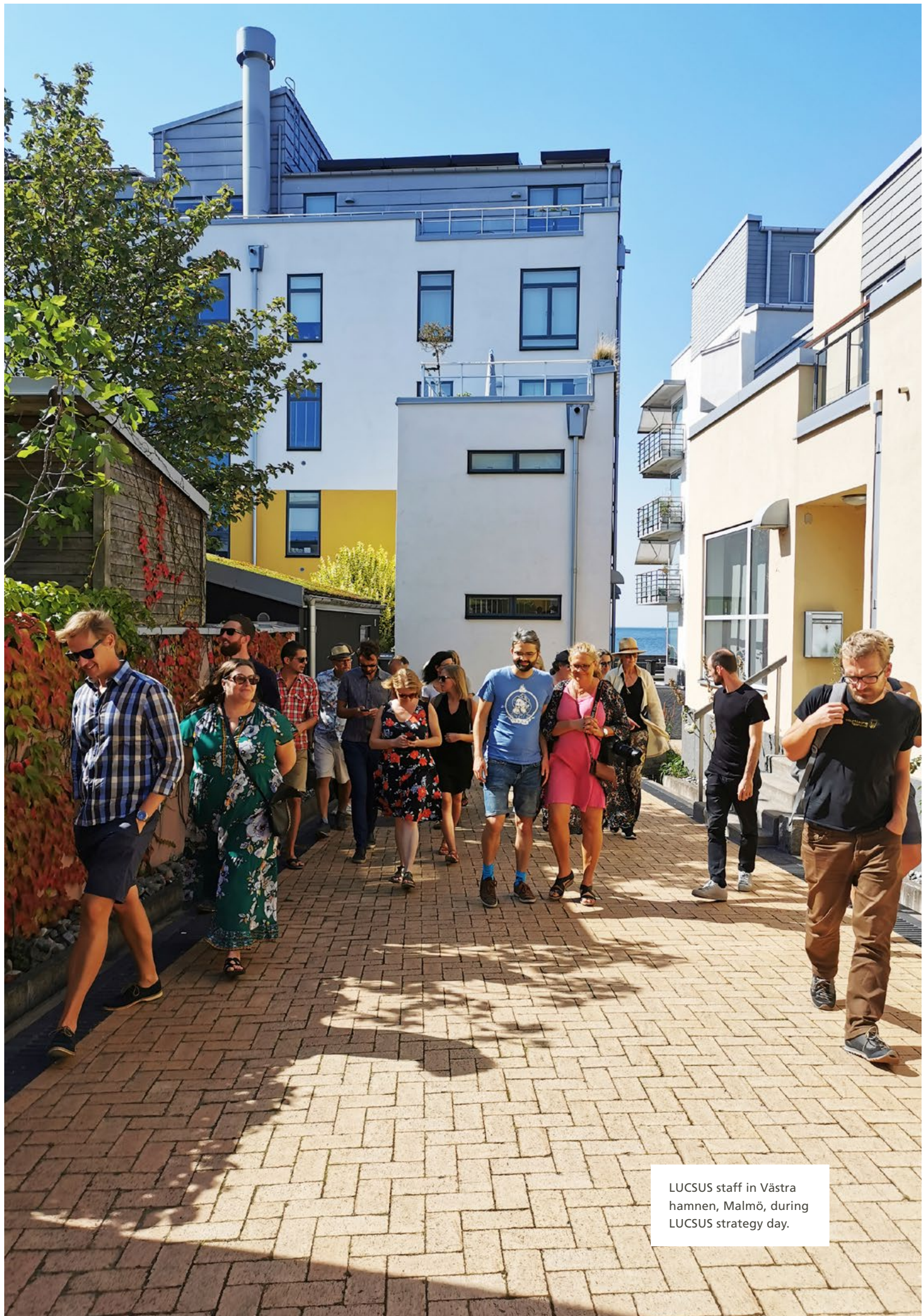
LUCSUS staff in Västra hamnen, Malmö, during LUCSUS strategy day.